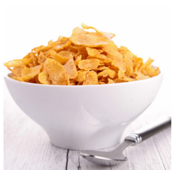
Cereal 18 oz. box