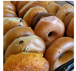
Wheat Bagel 1 - 4 oz. bagel