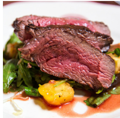
Top Sirloin Steak 1 lb.