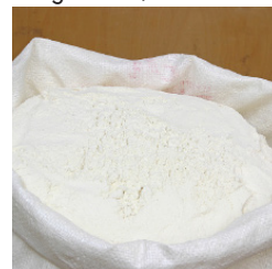
Flour King Arthur, 5 lbs.