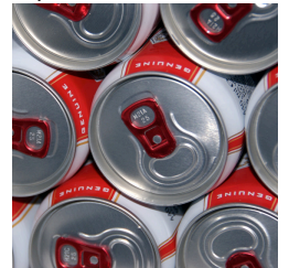
Beer 6-pack cans