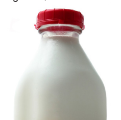
Milk 1 gallon, fat free