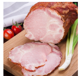
Boneless Ham 1 lb.