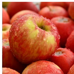
Fresh Apples 1 lb.