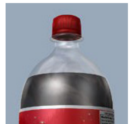
Soda 2 liters