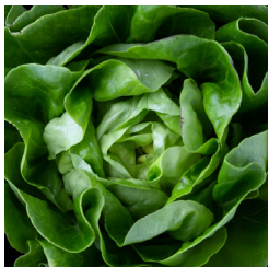
Lettuce 1 lb.