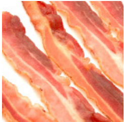
Bacon 1 lb.

Did you know that farmers and ranchers receive only 14.3* cents of every food dollar that consumers spend? According to the USDA, off farm costs including marketing, processing, wholesaling, distribution and retailing account for more than 80 cents of every food dollar spent in the United States.