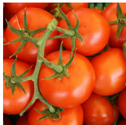
Tomatoes 1 lb.